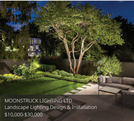
MOONSTRUCK LIGHTING LTD Landscape Lighting Design & Installation $10,000-$30,000