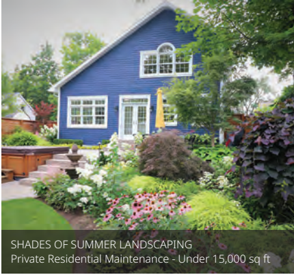
SHADES OF SUMMER LANDSCAPING Private Residential Maintenance - Under 15,000 sq ft