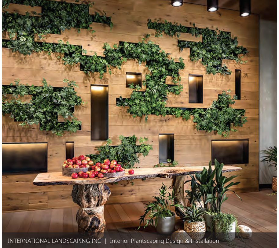
INTERNATIONAL LANDSCAPING INC | Interior Plantscaping Design & Installation