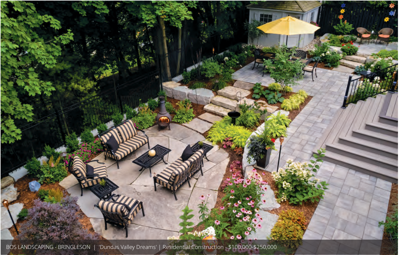
BOS LANDSCAPING - BRINGLESON | 'Dundas Valley Dreams' | Residential Construction - $100,000-$250,000