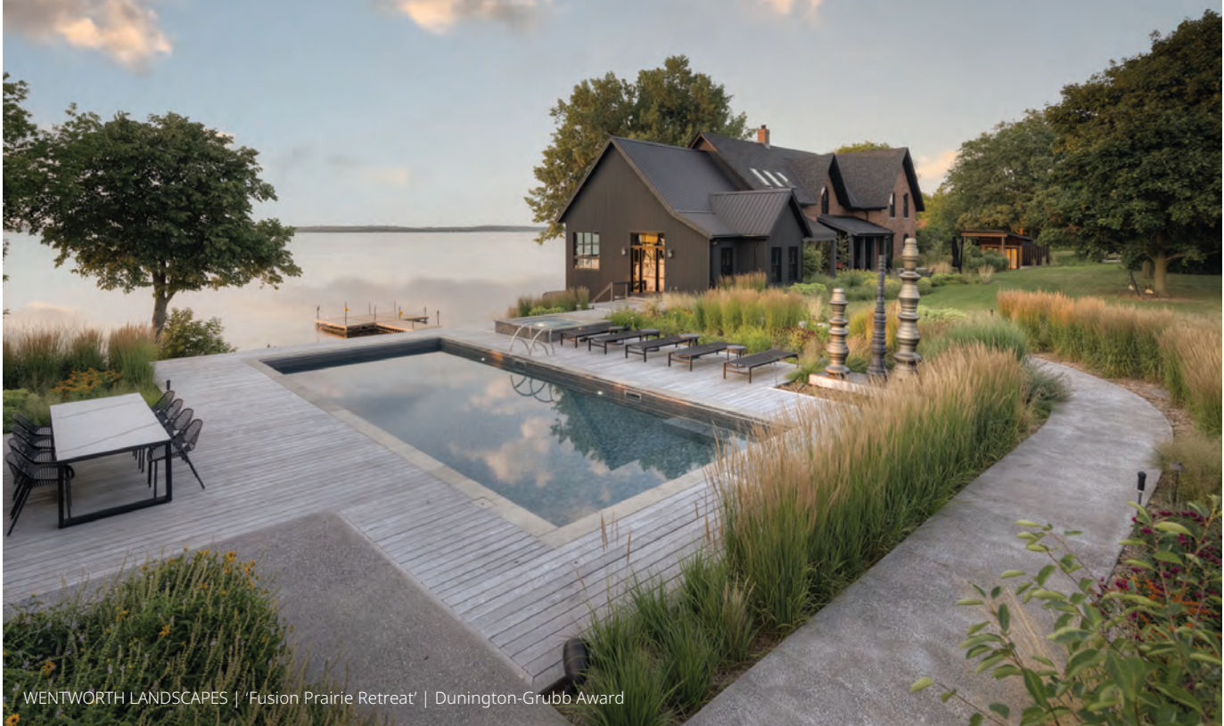
WENTWORTH LANDSCAPES | 'Fusion Prairie Retreat' | Dunington-Grubb Award

To view highlights or a full replay of the awards ceremony, visit LOawards.com or YouTube.com/landscapeontario .