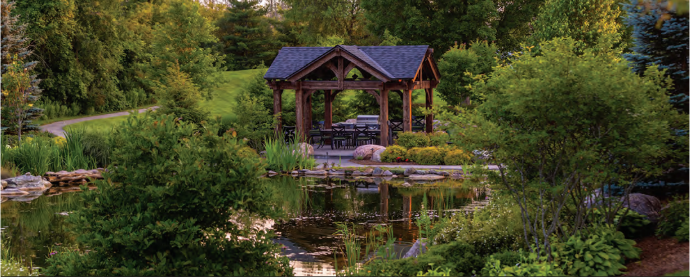
JACKSON POND | 'Swim pond Paradise' | Water Features