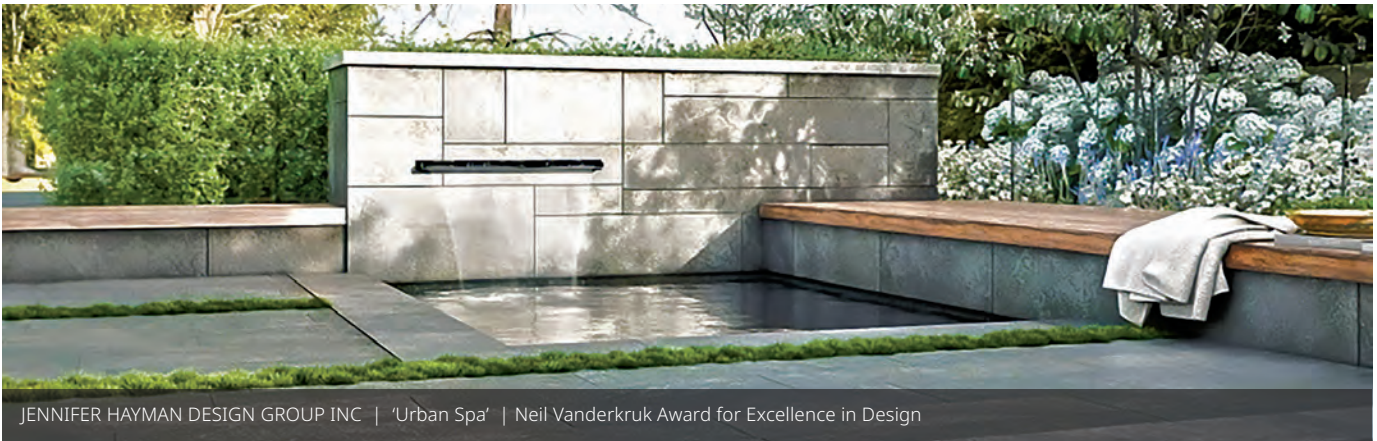
JENNIFER HAYMAN DESIGN GROUP INC | 'Urban Spa' | Neil Vanderkruk Award for Excellence in Design