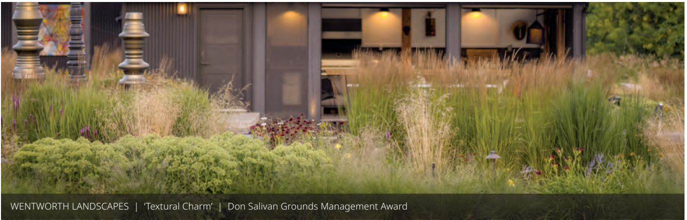
WENTWORTH LANDSCAPES | 'Textural Charm' | Don Salivan Grounds Management Award